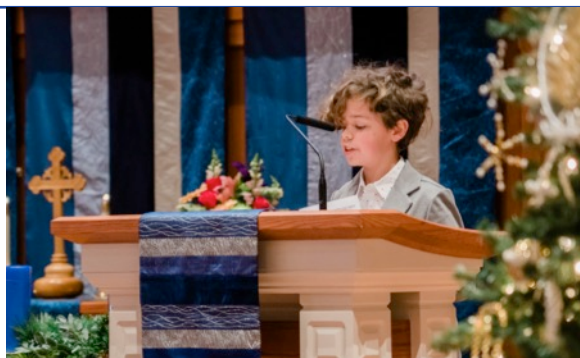
Children's Christmas Program December 8