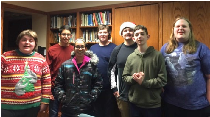
Pen and Paper Group

Confirmation Class: TBA – will continue either late January or early February.