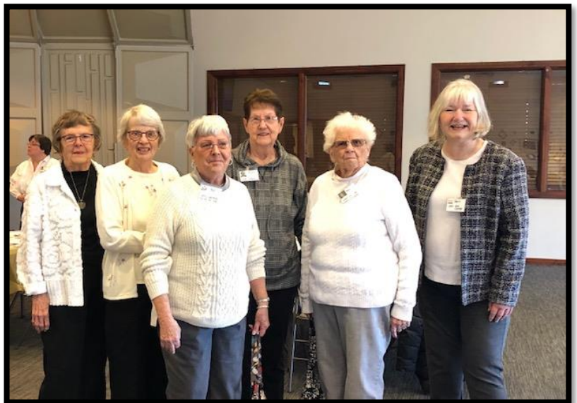
Women attending Annual Fox Valley UMC Women's Luncheon at West Chicago UMC

The 2021 Cluster Luncheon will be hosted by Baker Memorial UMC.