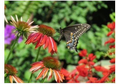
Black Swallowtail in Fran's Garden

Want to learn more? Stop by the website of the Xerces Society , for more about what you can do to protect pollinators. - Fran Manos, Creation Care